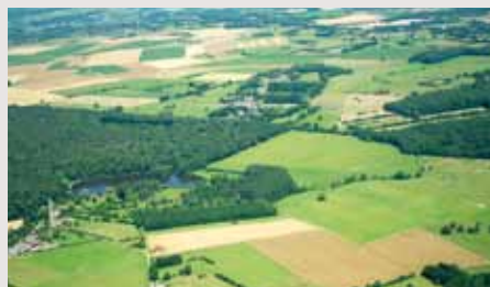
Some rough outlines for possible developments